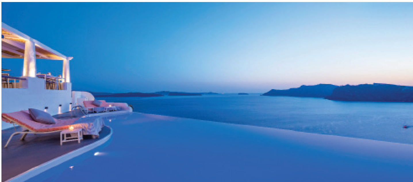
One of the hotel's three luxury infinity pools