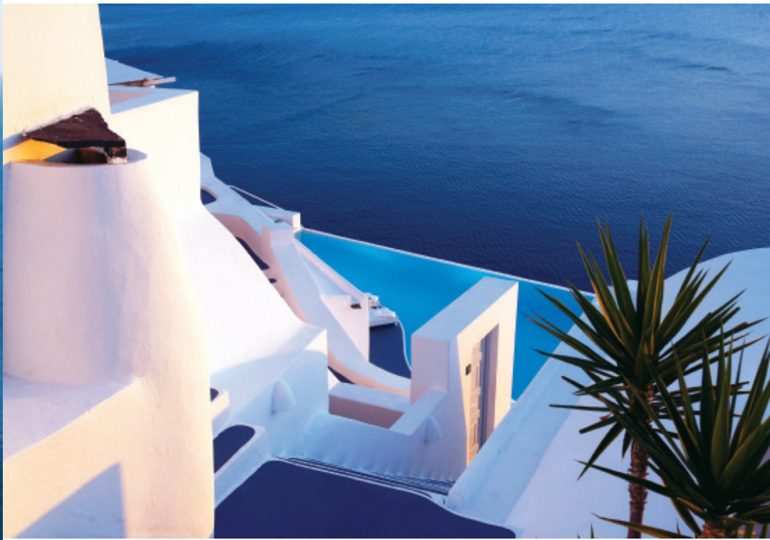
Katikies' layout mirrors that of the town of Oia