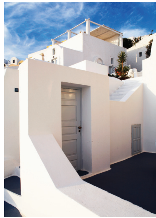
The entire exterior is pristine in white