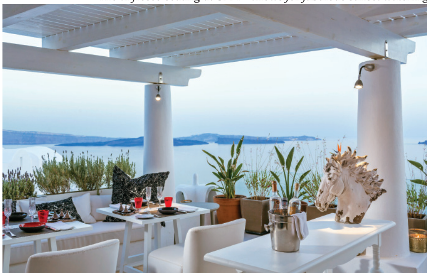
The Grecian pavilion of Mikrasia