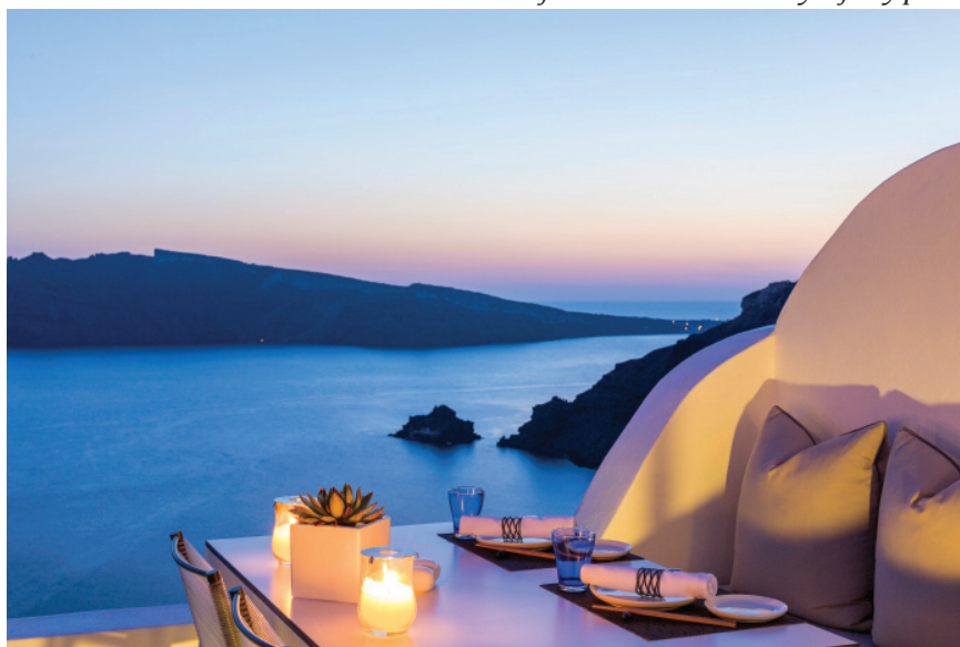
The al fresco seating at SELTZ allows for fabulous sunset watching

Guests can fully relax at the A.SPA , located a short, beautiful walk away at its sister resort Kirini Suites & Spa, where Katikies promises a holistic spa experience. Imagine an immaculate white cave, bathed in the light of glowing candles and relaxing pools. The A.SPA is a serene refuge where guests may undergo an array of pampering treatments from facials to customised massages and pedicures.