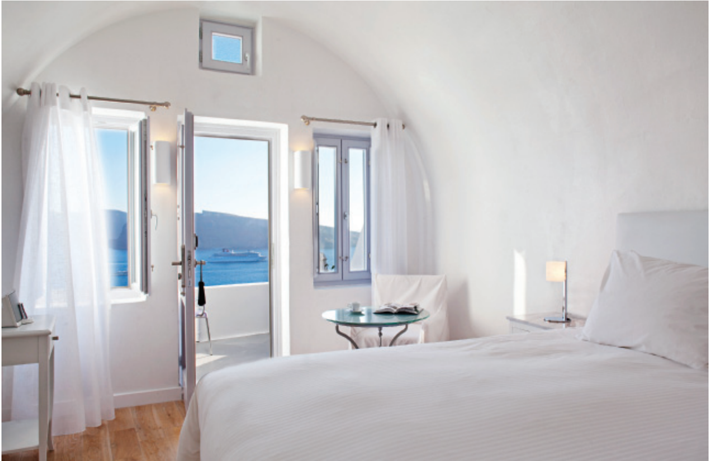
Every single room offers a stunning view of the Aegean waters