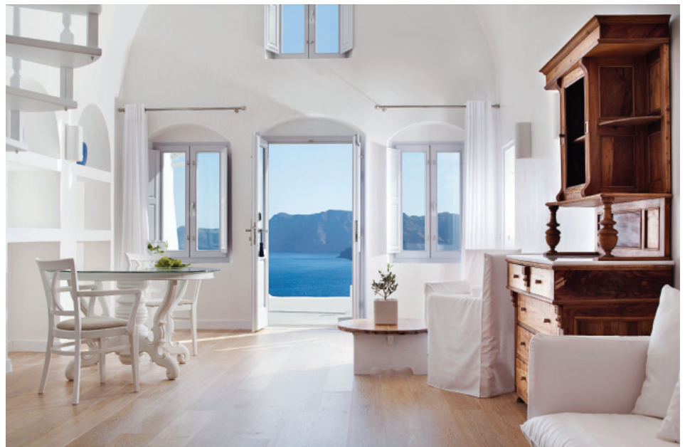
The simple and natural ethos of the Katikies Suite is one of sheer relaxation

For those seeking the grander things in life, the Master Suite offers a self-sufficient haven. The 40-square-metre suite is characterised by its open-plan bedroom with a separate dressing room and bathroom. A veranda and open-air dining room aren't the only outdoor pleasures; the suite has its own plunge pool and sundecks for private sunbathing. With butler service available on request, you might never need to leave this exclusive abode.